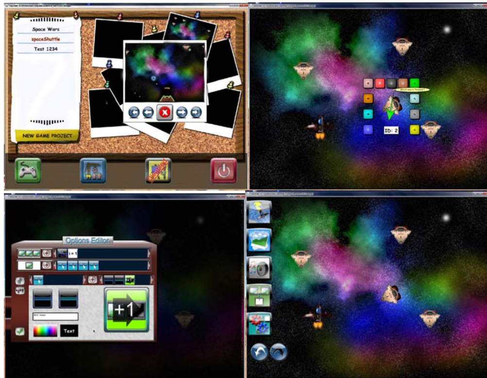
Figure 1: Some screenshots of Gatlock and game designed by a nine-year-old child.

From these three contexts – programming context, computer game context and game design context – used in design of Gatlock, we have plan future studies including evaluations not just on students' programming skills, but also on their attitudes and interests in game making activities. But in this paper we only describe the usability test conducted in Malaysia.